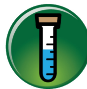
Labs & Imaging